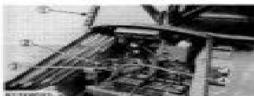
11460-11469 10/01 11/40 (1) Grip (2) PTO Clutch Lever (3) ATA PTO Cable (4) PTO Clutch Wire