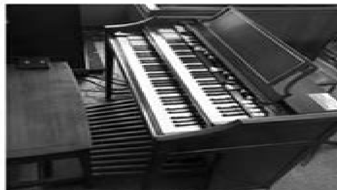
Fig. 6. Hammond A-101L. Originally marketed for homes.