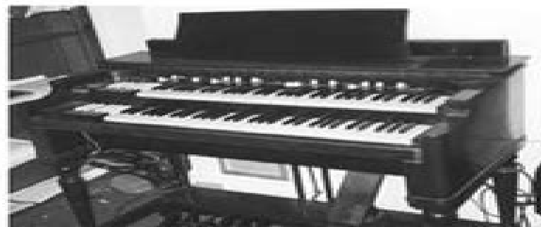
Fig. 8. Hammond A. The first Hammond organ.