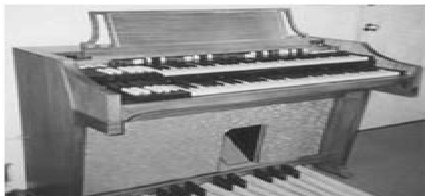
Fig. 5. Hammond A-100. Originally marketed for homes.