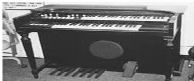
Fig. 7. Hammond M3 Spinet Model