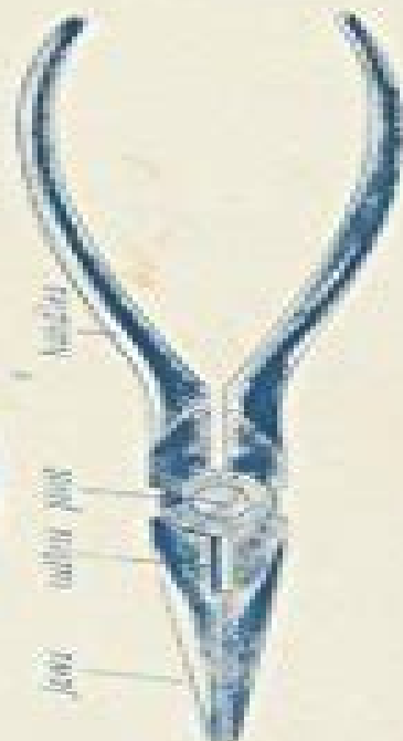
Diagram illustrating the components of a mechanical device, likely a sphygmomanometer or similar instrument. The components are labeled as follows: screw shaft body joint pin oil port screwed end oil bag collar sleeve screw ball-bearing cap shaft screw