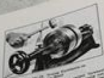
...and the ...

When wheels are out of true is a combination of any of conditions shown, correct A or B first, leaving rim of offending wheel only, and then correct condition C.