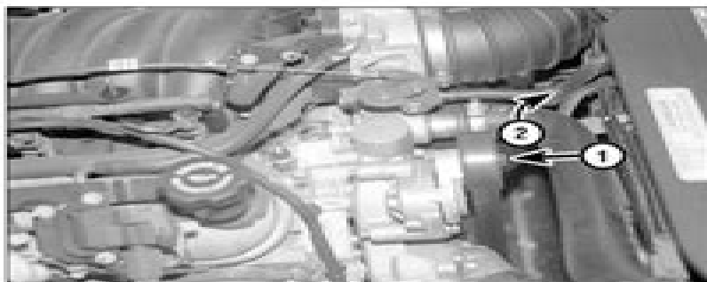
24.11 To remove the drivebelt, rotate the tensioner bolt (1), clockwise (2) to relieve belt tension (2007)