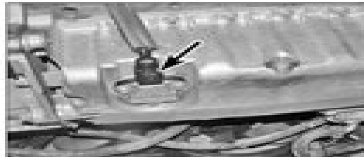
14.4 Disconnect the wiring connector from the oil level/temperature sender