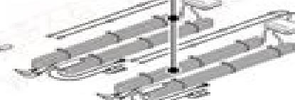
Cord with connector (E30-4953-05)