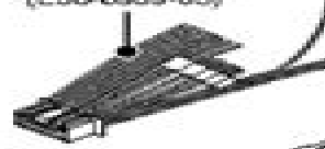
* DC cord (E30-6940-05)