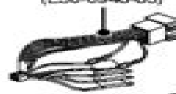
* Remote controller assy (RC-405) (A70-2104-05)