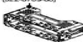
* DC cord (E30-6939-05)