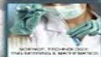
SCIENCE, TECHNOLOGY, ENGINEERING & MATHEMATICS