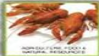
AGRICULTURE, FOOD & NATURAL RESOURCES