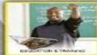
EDUCATION & TRAINING