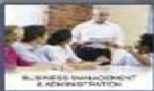
BUSINESS MANAGEMENT & ADMINISTRATION