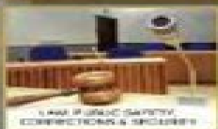
LAW, PUBLIC SAFETY, CORRECTIONS & SECURITY