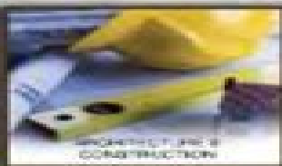
ARCHITECTURE & CONSTRUCTION