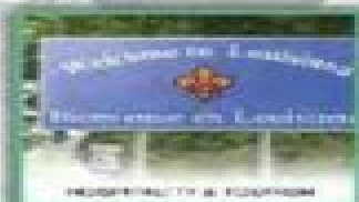
HOSPITALITY & TOURISM