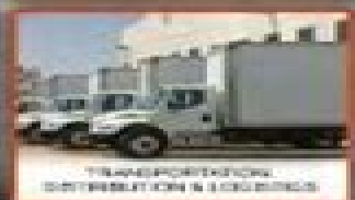
TRANSPORTATION, DISTRIBUTION & LOGISTICS