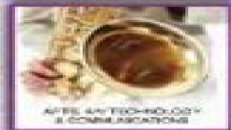
ARTS, ARTS & TECHNOLOGY & COMMUNICATIONS