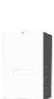
Top Return without Coil Box