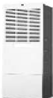
Front Return with Coil Box