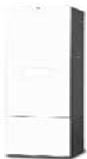
Top Return with Coil Box