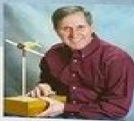
About the author