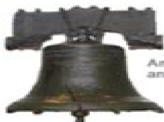
American History and Geography