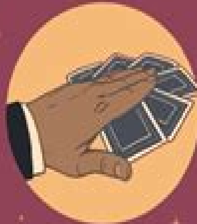
The Magnetic Hand