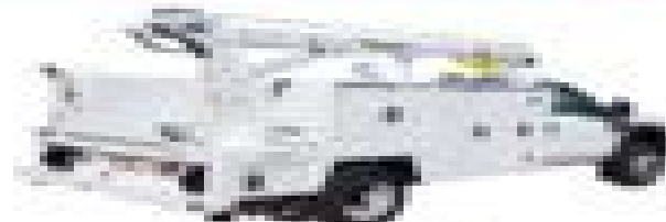
Side view crane down