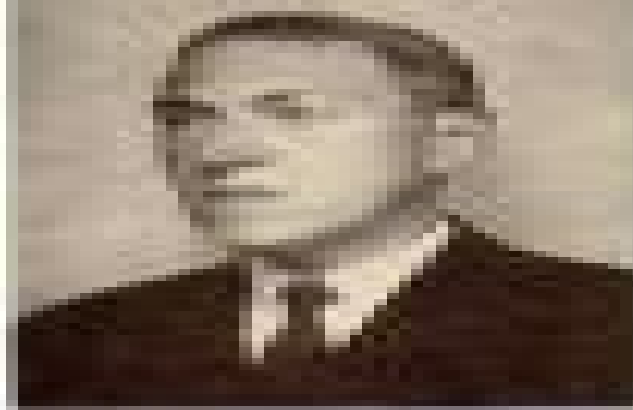
Howard Phillips Lovecraft