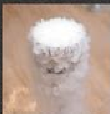
DRY ICE ICE CREAM