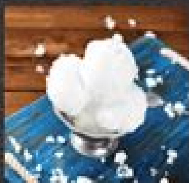
SNOW ICE CREAM