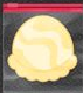
ICE CREAM IN A BAGGIE

Make ice cream using freezing point depression, supercooling, and cryogenics.