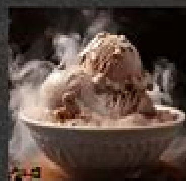
HOT ICE CREAM