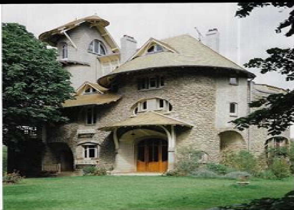
CROFTON BY BRIDGEMAN View of main facade Overview of main facade Overview of left facade