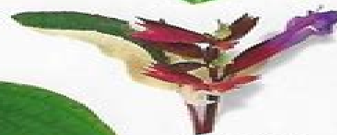
Variegated Purple Sage