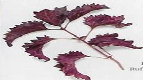
Purple Ruffles Basil