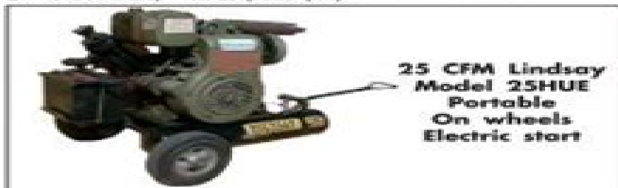
25 CFM Lindsay Model 25HUE Portable On wheels Electric start