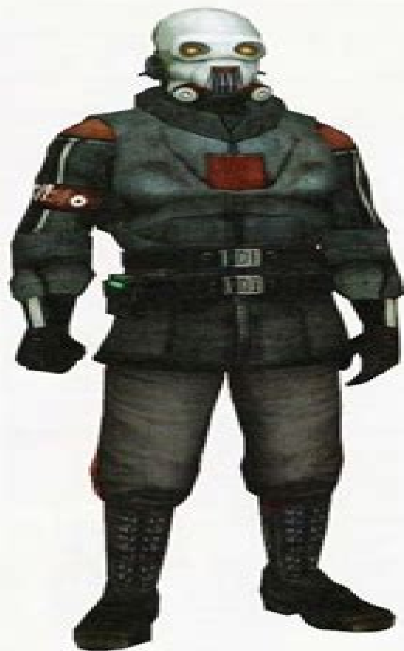
Elite Metro Cop