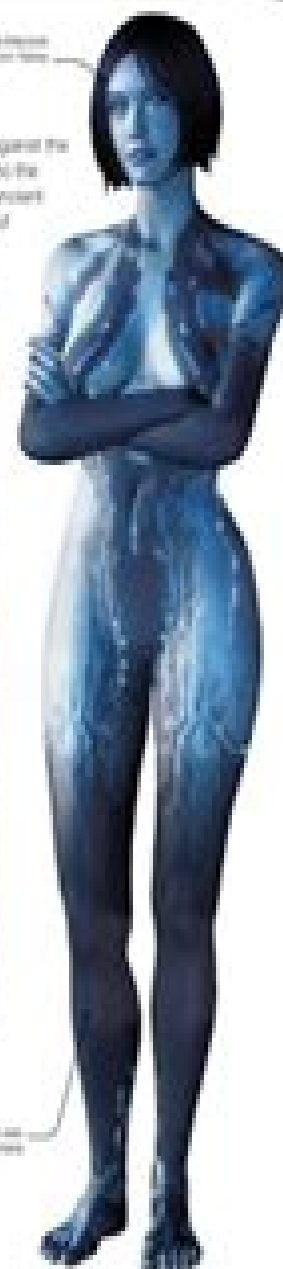
Cortana's armor was made of Mjolnir.