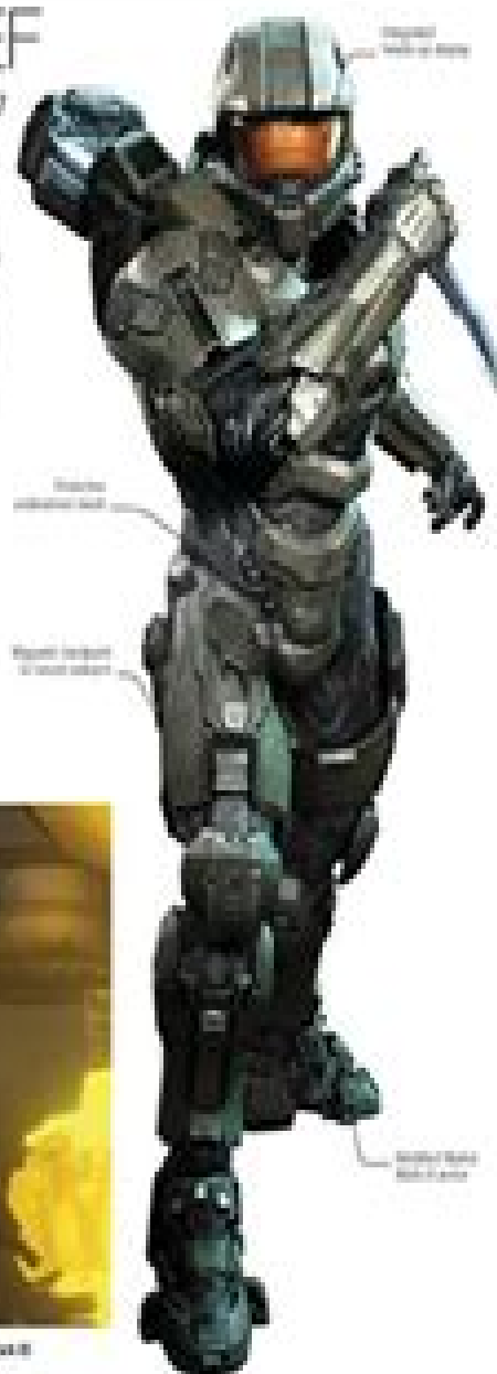
Master Chief's armor is made of Mjolnir.