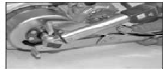
15.13c ...then hold the rotor and tighten the nut