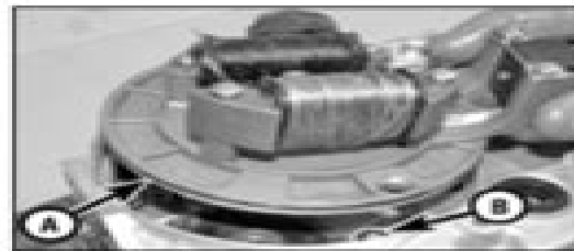
15.11 Stator plate large O-ring (A) and two small O-rings (B – bottom shown)