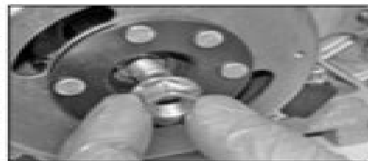
15.13b ...fit the nut...

14 Reconnect the generator wiring and fit the left-hand engine cover.