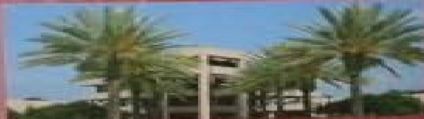
Boca Raton Campus