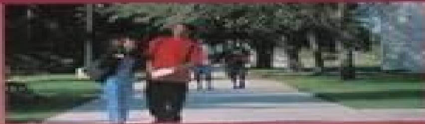
Palm Beach Gardens Campus

CUSTOM EDITION FOR PALM BEACH COMMUNITY COLLEGE