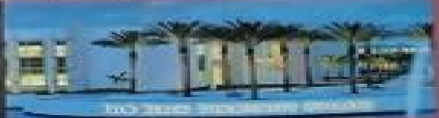
Lake Worth Campus