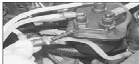
18.3 Disconnecting one of the fuel lines