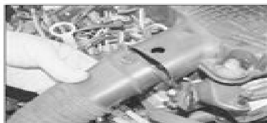
17.1 Disconnecting the air intake pipe