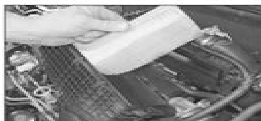
17.3 ... and lift out the air filter element