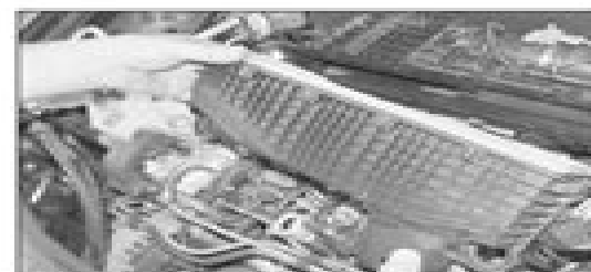
17.2b ... release the air filter housing ...