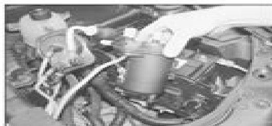
18.6 Dispose of the old filter and fit new filter into mounting bracket