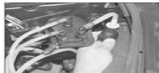
18.7 Squeeze the hand pump to fill filter with fuel