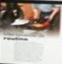
Le scooter : une machine complexe