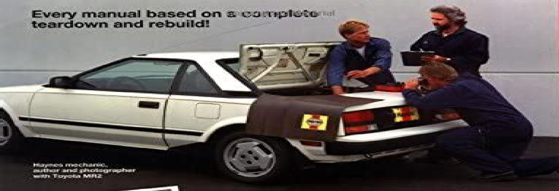
Haynes mechanic, author and photographer with Toyota MR2

Every manual based on a complete teardown and rebuild!