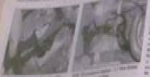
1. Check the front suspension for wear and tear. 2. Inspect the rear suspension for proper alignment.

1. Check the front suspension The front suspension is responsible for supporting the weight of the vehicle and absorbing road irregularities. It consists of several components, including the springs, shock absorbers, and control arms. Regular inspection and maintenance of these parts are crucial for a smooth and safe ride. 2. Inspect the rear suspension Similar to the front suspension, the rear suspension supports the vehicle's weight and absorbs road bumps. It typically includes rear springs, shock absorbers, and a rear differential. Checking for wear and tear in these components is essential for maintaining proper vehicle alignment and handling. 3. Check the steering system The steering system allows the driver to control the direction of the vehicle. It includes the steering wheel, steering rack, and tie rods. Ensuring that the steering system is in good working order is vital for safe driving.