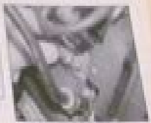
9. Check the fuel system for proper operation. 10. Inspect the exhaust system for leaks and damage.