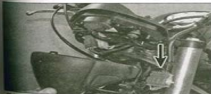
19.2a Handlebar switch wiring connectors (arrowed) - early CB

3 To access the connectors, on CB600F/FA and CBR600F/FA models remove headlight (Section 8), on CBF600N/NA models remove the headlight beam unit (Section 7), and on CBR600S/SA models remove the fairing (see Chapter 7). Trace the wiring from the switch and disconnect it at the connector(s) (see Illustrations). Check for loose or broken connections.