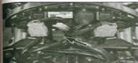
18.2a Ignition switch wiring connector (arrowed) - CBR