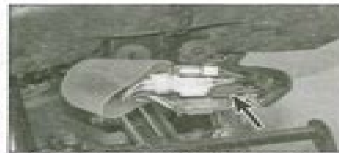
18.2b Ignition switch wiring connector (arrowed) - CBF-S/SA