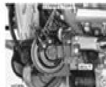
Fig. 10-20-106 Remove bolt 6 W/TM/AM/AM

Remove the cam chain tensioner after test and timing marks.