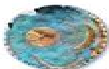
Bronze Age Nebula Sky Disk