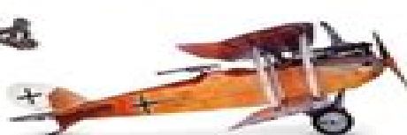
WWI German reconnaissance aircraft