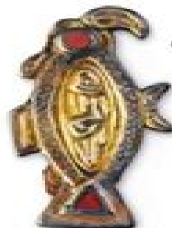
Anglo-Saxon bird brooch