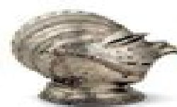
18th-century German eagle talisman