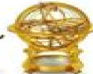
18th-century English armillary sphere