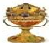
Holy Roman Empire reliquary