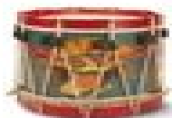
Civil War drum