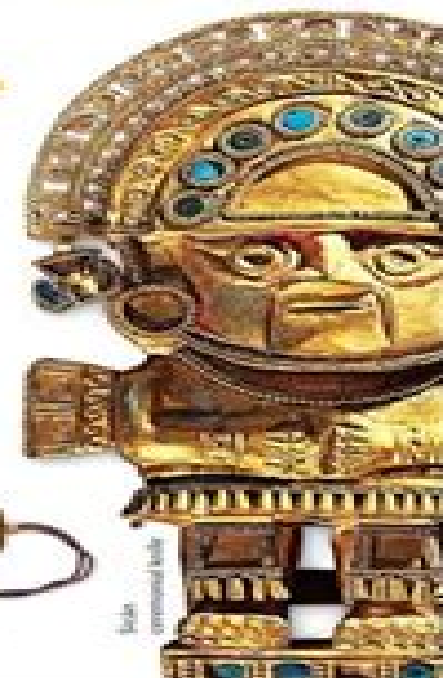
Large ceremonial mask