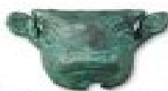
Mesopotamian bull's head