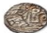
12th-century Indian silver coin