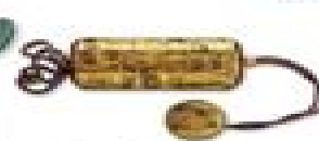
Japanese Edo pouch