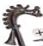
Viking animal head decoration