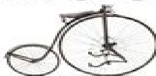
19th-century European Pacific safety bike