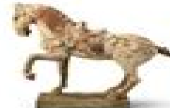
Tang ceramic horse