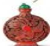
Qing snuff bottle