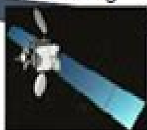
Intelsat 8 (1997) 3400 kg