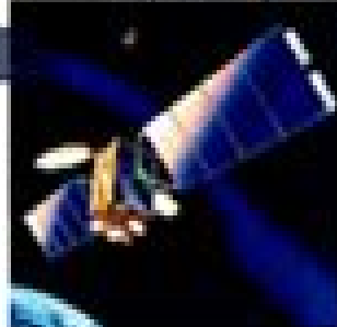
Intelsat 7 (1993) 3695 kg