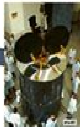
Intelsat 4 (1971) 1570 kg