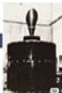
Intelsat 3 (1968) 349 kg