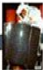
Intelsat 1 (1965) 81 kg