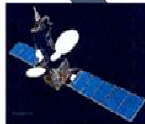
Intelsat 6 (1986) 4320 kg