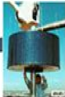
Intelsat 2 (1966) 198 kg