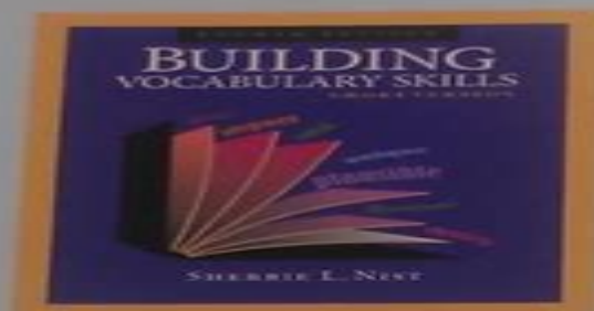
BUILDING VOCABULARY SKILLS, Short Version, 4/e Sherrie L. Nist