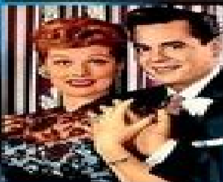
Lucille Ball & Desi Arnaz

A TRIBUTE TO THE GLORY DAYS OF ENTERTAINMENT & THE WAY WE WERE