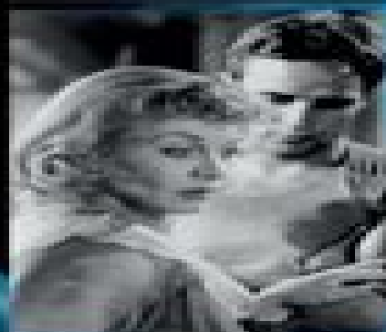
Marlon Brando & Marilyn Monroe