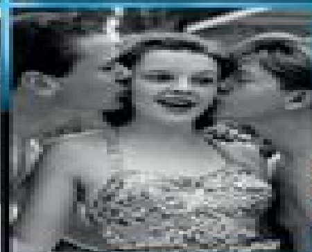
Judy Garland (with Martin Luther King Jr. & Martin Luther King Jr.)