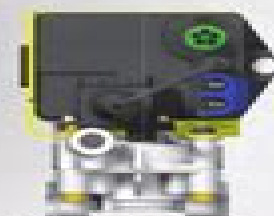
6-Port ABS Relay Valve

2S/1M - 4S/2M PLC Select Anti-Lock Braking Systems