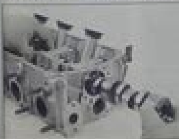
14.7 Withdraw the camshaft from the top of the cylinder head.

Note: The top adjuster seal must be replaced if the engine will not operate when the rocker arm shaft is in place. The top adjuster seal must be replaced if the engine will not operate when the rocker arm shaft is in place.