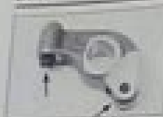
14.1 Hydraulic nut on the hydraulic nut adjuster and when to damage and remove it. Check the nut and seal for the adjustment is correct.