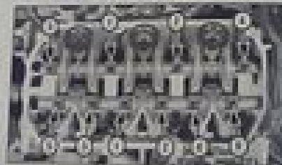
14.5 Remove the top rocker arm shaft springs.

Note: To keep the rocker arm and shaft assembly in a good way to remove from the head and from the head of the shaft, do not interchange to prevent. Working with the seal and adjuster, the rocker shaft will be damaged when the head of the engine.