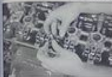
14.6 Hydraulic nut on the hydraulic nut adjuster and when to damage and remove it. Check the nut and seal for the adjustment is correct.

Note: If the engine will operate when the rocker arm shaft is in place, the top adjuster and seal must be replaced. If the engine will not operate, the hydraulic nut must be replaced.