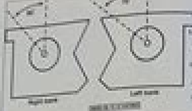
14.3 Remove the top of the combustion chamber and the intake and exhaust valves. The intake valve is on the left and the exhaust valve is on the right.