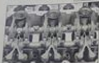
14.2 The top rocker arm shaft springs must be removed as shown.