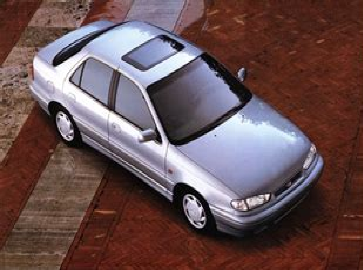
Taurus GLX a gas para