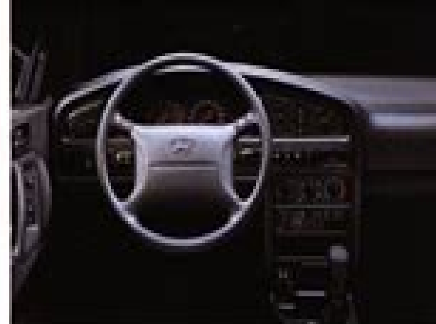
Reglaje de espejo, clima y radio control por voz