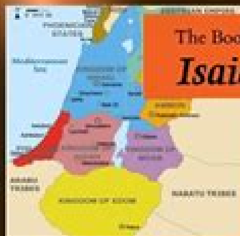
The Book of the Prophet Isaiah 1-39