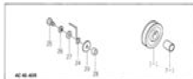
Fig. 1 BELT DRIVE