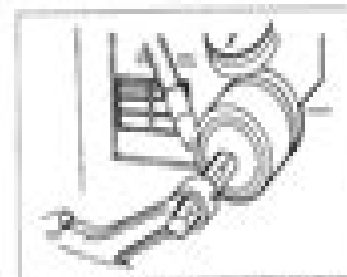
Figure 13: Finding the Corresponding Real Power for Real Power