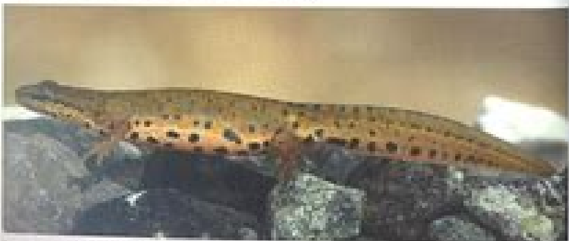
Female Smooth Newt, sp. greenii N. Greece