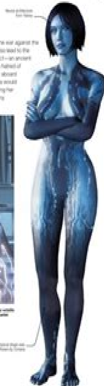
Head: Made of metal