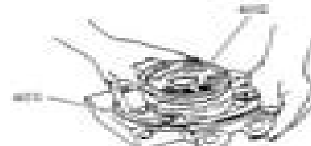
Fig. 63 Installing control plate (402)