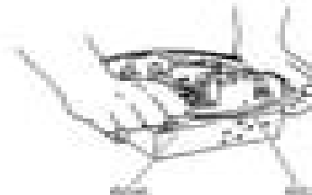
Fig. 60 Installing cylinder (601)