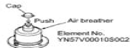
Bleeding internal pressure of tank