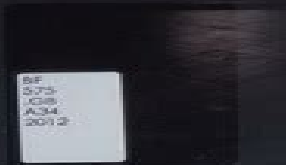
ILLUSTRATION BY JACOB