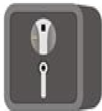
Safe or lockbox for handguns

Gun safes can lower the risk a curious child will be hurt: