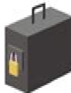
Lock box for ammo