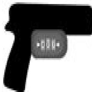
Gun trigger locks— inexpensive and effective