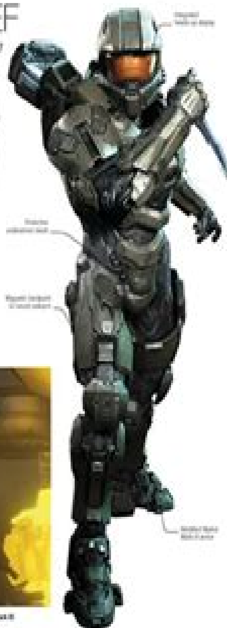
Master Chief's armor is made of a composite material.