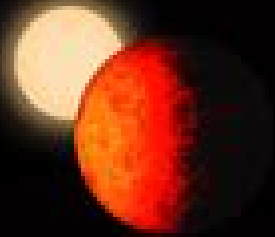
KEPLER-20e DECEMBER 2011