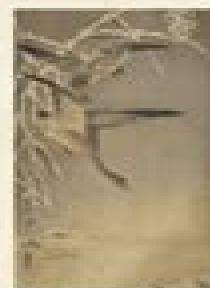
Ohara Shinsui (Kawachi) (1877-1940) Gaze of Spring in Snow , c. 1930s