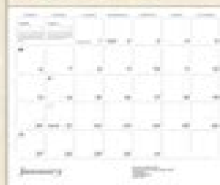
Itō Shinsui (1898-1972) Beauties, January , 1979 calendar, 1979