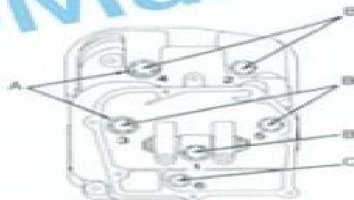
Fig. K107—When tightening cylinder head bolts, follow sequence shown. Refer to text.

Connecting rod small-end inside diameter should be 20.015-20.025 mm (0.7889-0.7884 in.) and wear limit is 20.07 mm (0.790 in.). Connecting rod big-end standard inside diameter should be 33.500-33.525 mm (1.3189-1.3199 in.). Crankpin standard inside diameter