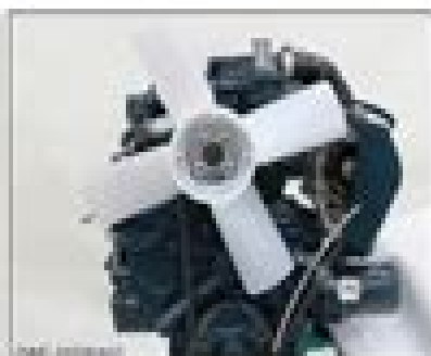
(7) Drain plug