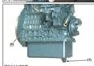
(7) Drain plug (8) Topset